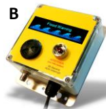
Train Device (TD) PT-0201 placed in operator's cab Interfaces: Ethernet, RS232, RS485, RS422, TTL, SPI